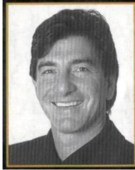
T. Harv Eker